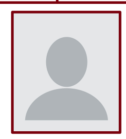
Member At Large Potential Available Seat